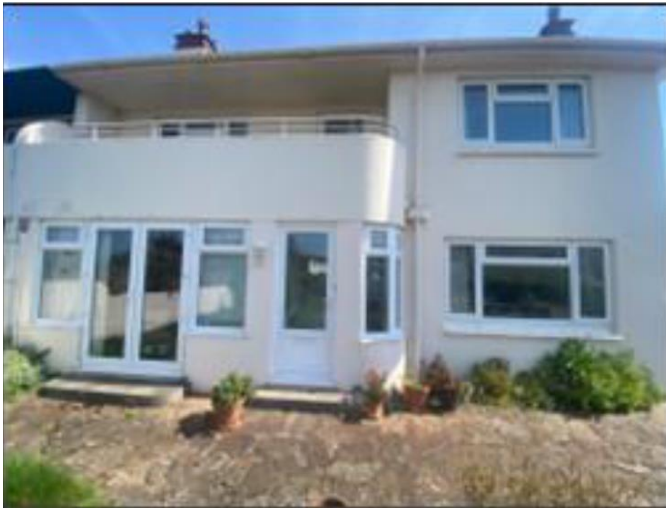
Front of Seawood House

“Seawood House” is situated on Tower Road in the Parish of St Helier.