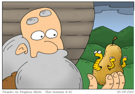
WE WERE TOLD YOU WERE TAKING CREATURES THAT CAME TO YOU IN PEARS