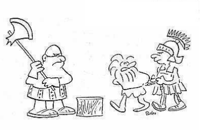
"You've got the wrong man, I tell you! — I'm John the Methodist!"

More jokes to appear next week - please keep them coming.